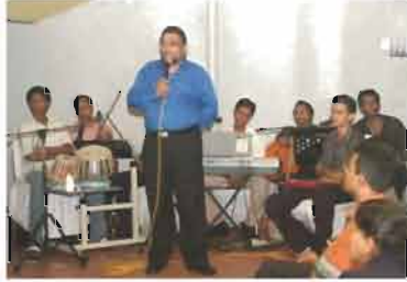
The Director PGIM gracefully welcoming all the invitees.

An evening of entertainment was the last but by no means the least activity of the 27 th Anniversary PGIM Academic Sessions. It was a fine dining experience in the form of a traditional Sri Lankan dinner backed up by fabulous oriental