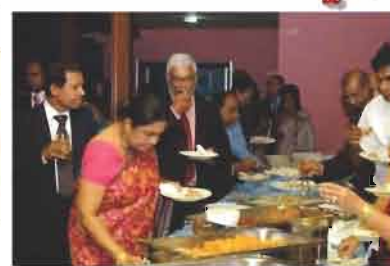
Crispy crunchy cocktails on offering