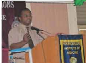
Early sub specialty training is the need of the hour: Dr. Harsha De Silva