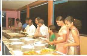
PGIM Staff and their family members mesmerizing themselves.

music which kept the toes tapping till late in the evening on 20 th October 2007.