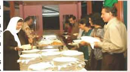
Buffet in full swing: invitees helping them selves at the Pinnacle

It was a splendid buffet with a plenty of pre cooked and live stations adding colour to the evening and as much as variety. The Pinnacle Dining area was taken by a storm as local delicacies