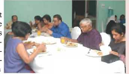
Invitees and the members of the organizing committee sharing the days experiences.

like Kottu and Hoppers were seen dishing out at a rampant.