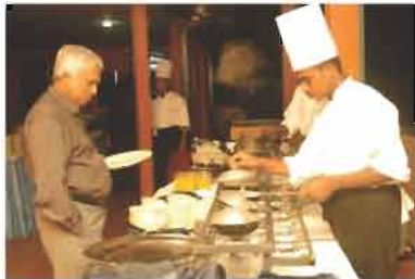
Professor of Paediatrics patronizing the Hopper station

The evening got underway with a welcome address delivered by the Director PGIM where he extended his heart felt gratitude to all those who contributed in a friendly man-